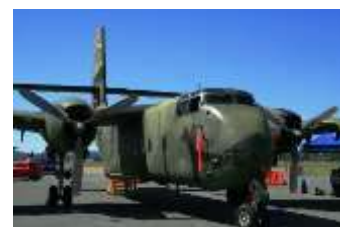
Recognising the Aviation History of RAAF Base Amberley